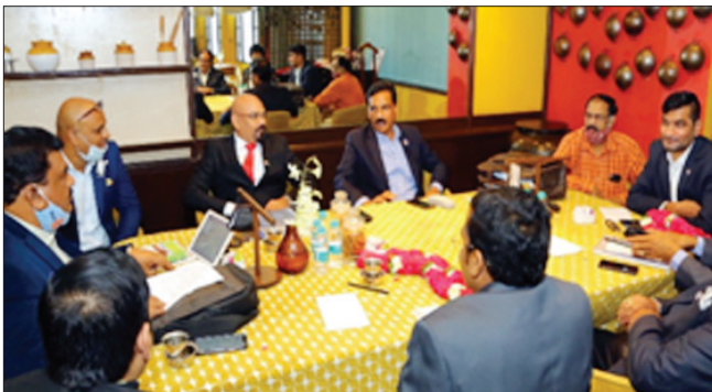
DG Closed door Meeting with Core Team