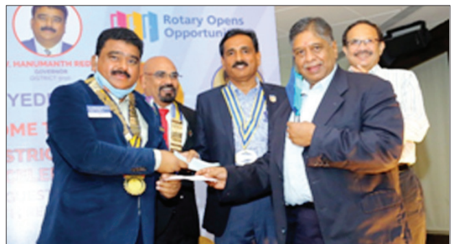
Rotary Foundation Contribution made