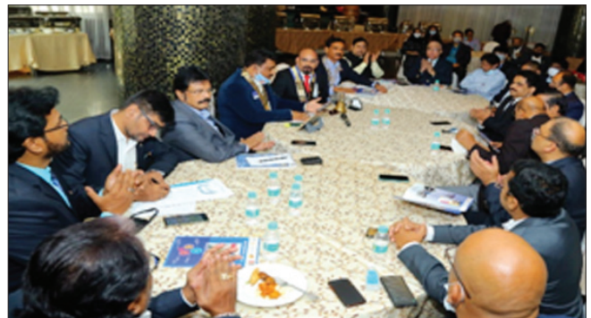
DG conducted Club Assembly