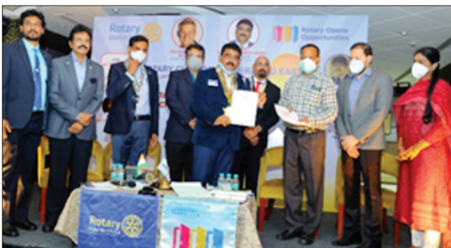
Exchanged MOU with Osmania Hospital team for Skin Bank project