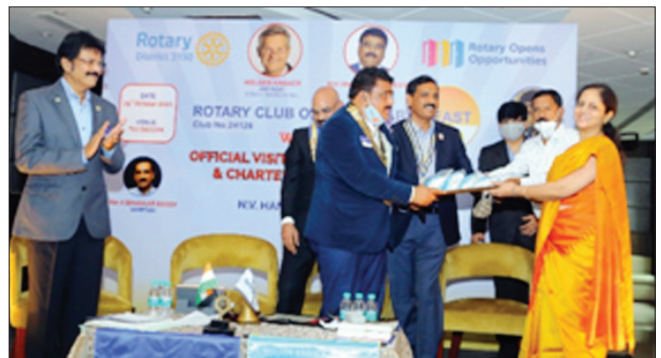
RCHE made a donation to Sadhana Institute