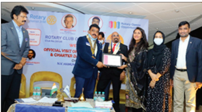
Presented the Charter to Rotaract Club of Trail blazers